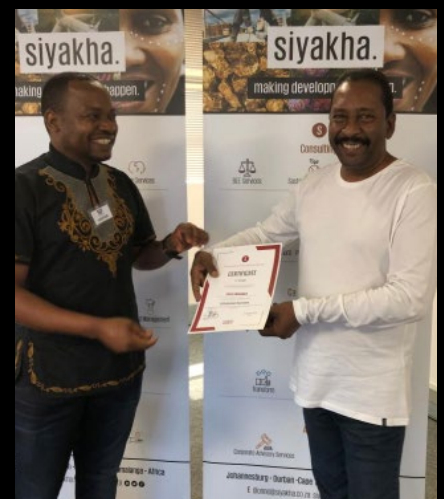
Bootcamp Award Ceremony