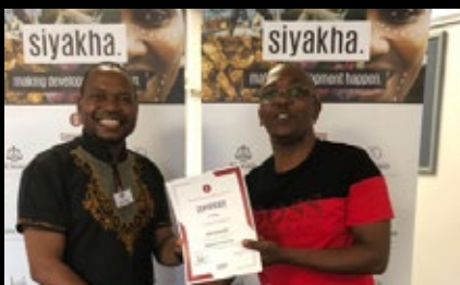
Bootcamp Award Ceremony