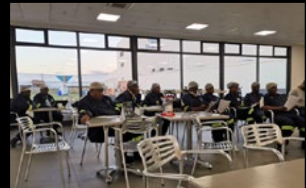
Employee Briefing Session

"I have some great news, I've just gotten a job offer! Although I have found a job, which was the goal at the end of the day, I would still like to continue with our career coaching sessions as they have helped me so much and I feel I could still benefit from further sessions to continue growing"