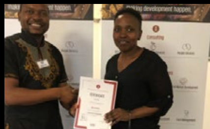
Bootcamp Award Ceremony